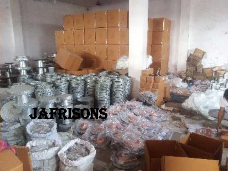
THIRD FLOOR PACKING AREA